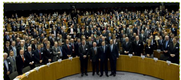
First Covenant of Mayors Signature Ceremony at the European Parliament, Brussels, Belgium (10 th February 2009)